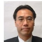
Shuichi Abe Deputy Mayor of Yokogama