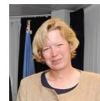
Gabriella Bennemann General Councilor of Germany in Saint-Petersburg