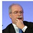
Christophe De Margerie

Head of Internal Policy of Presidential Administration of the Russian Federation