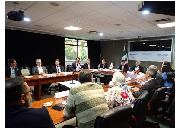
Joint Statement Discussion at CENAPRED