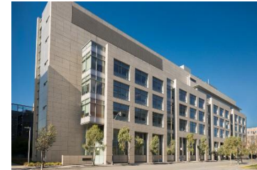
Shinya Yamanaka (PI)