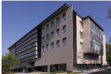
Shinya Yamanaka (PI)