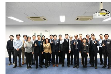
Shanghai-Kyoto Chemistry Forum, October 2024 (Kyoto)