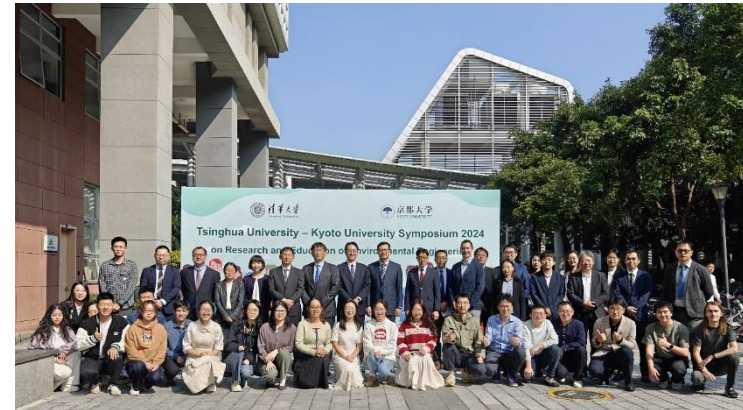
Symposium group photo at Tsinghua Shenzhen International Graduate School (TSIGS)