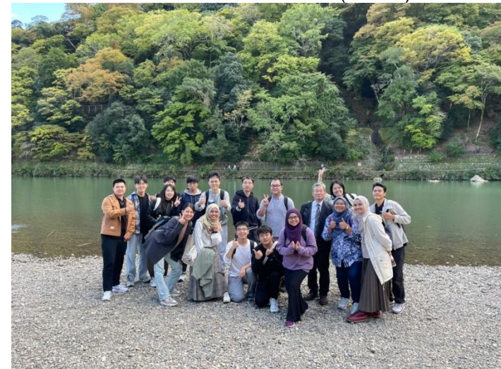
Cultural Exchange in JST Sakura Science Exchange Program