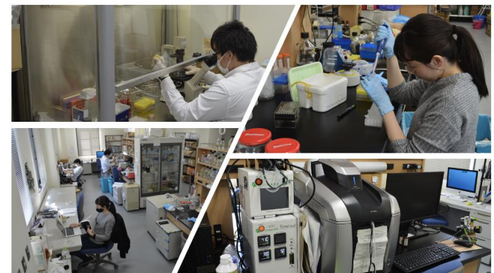
The IFOM-KU Joint Research Laboratory

IFOM-KU Joint Graduate Student Symposium (Milan, Italy, February 19, 2025)