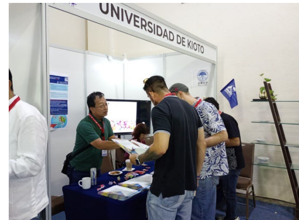
The booth exhibition in the Conference room