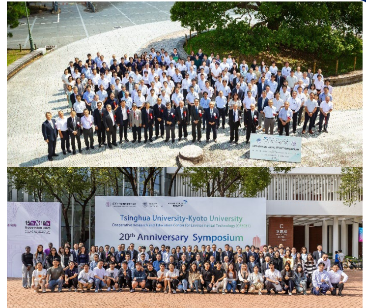
Group photo from the 20th Anniversary Ceremony and Symposium (Top: Kyoto Univ.; Bottom: Tsinghua Univ.)