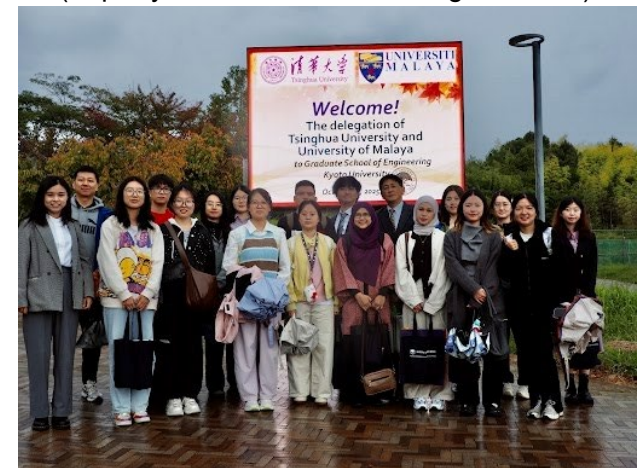
Group photo from Global Environmental Human Resource Development Program