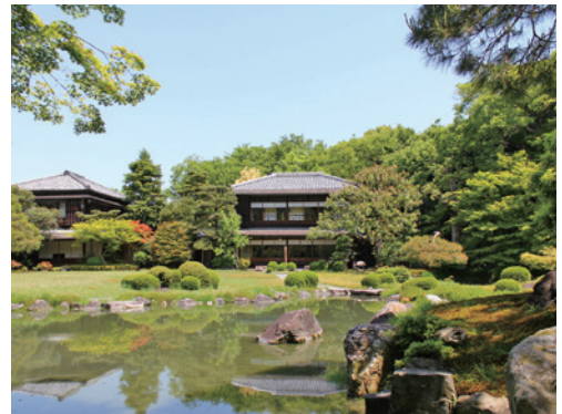
Kyoto University's Seifuso Villa, classified as an Important Cultural Property by the Government of Japan

*3 Monocle* Quality of Life Survey: Top 25 Cities (2019)