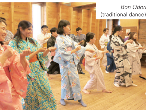
Bon Odori (traditional dance)

Students and researchers at Kyoto University find that the vibrant backdrop of Kyoto City brings constant inspiration and new discoveries in their daily lives and academic endeavors.