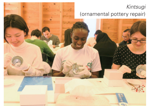
Kintsugi (ornamental pottery repair)