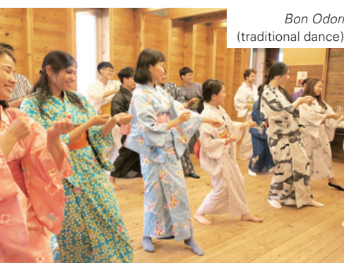
Bon Odori (traditional dance)

Students and researchers at Kyoto University find that the vibrant backdrop of Kyoto City brings constant inspiration and new discoveries in their daily lives and academic endeavors.