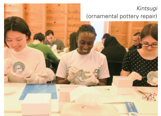
Kintsugi (ornamental pottery repair)