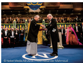
Dr. Tasuku Honjo, distinguished professor and deputy director-general of the Kyoto University Institute for Advanced Study (KUIAS), receiving the 2018 Nobel Prize in Physiology or Medicine.