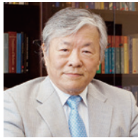
1987 Physiology or Medicine Susumu Tonegawa