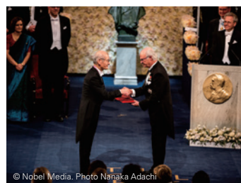
Dr. Akira Yoshino, honorary fellow of Asahi Kasei Corporation, professor at Meijo University, and alumnus of Kyoto University, receiving the 2019 Nobel Prize in Chemistry.