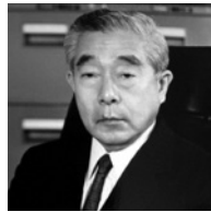
1981 Chemistry Kenichi Fukui