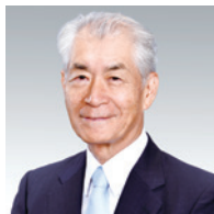
2018 Physiology or Medicine Tasuku Honjo