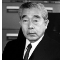
1981 Chemistry Kenichi Fukui