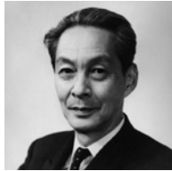
1965 Physics Sin-itiro Tomonaga