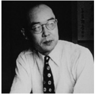
1949 Physics Hideki Yukawa