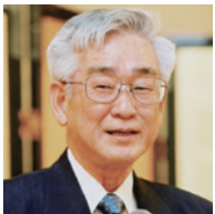
2008 Physics Toshihide Maskawa