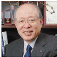
2001 Chemistry Ryoji Noyori