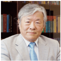
1987 Physiology or Medicine Susumu Tonegawa