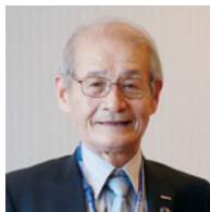
2019 Chemistry Akira Yoshino