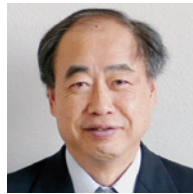
2008 Physics Makoto Kobayashi