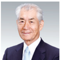
2018 Physiology or Medicine Tasuku Honjo