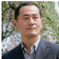
2012 Physiology or Medicine Shinya Yamanaka