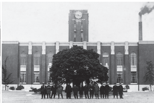
Students in front of the university clock tower (circa 1928)