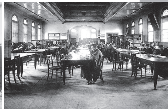
The university library in the Meiji period (circa 1909)