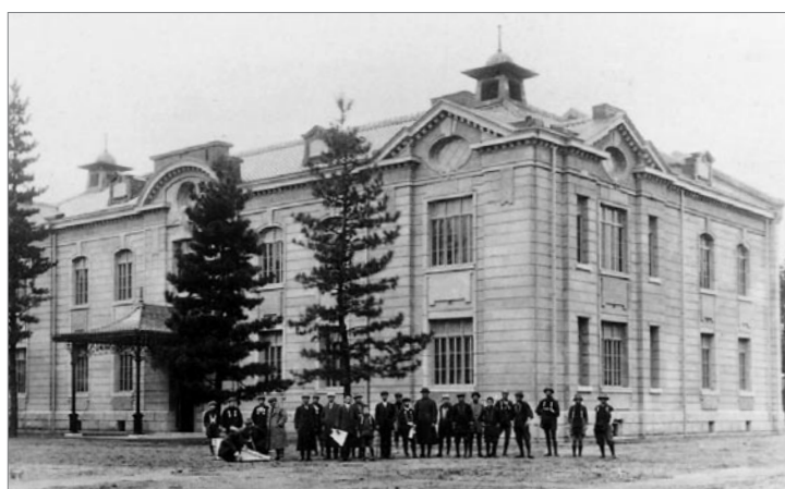
Chinretsukan , shortly after its construction

Japan's first university museum was founded a hundred years ago when Kyoto Imperial University established a museum called Chinretsukan (Exhibition Hall) in the Liberal Arts College to store specimens and utilize them for research and education.