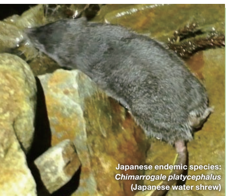
Japanese endemic species: Chimarrogale platycephalus (Japanese water shrew)

Discussion sessions focused on the importance of maintaining a specimen network and of incubating the next generation of specimens. After the symposium, a two-day field excursion to the University of Malaya's Ulu Gombak Forest Reserve was organized, providing the participants with an opportunity to exchange field survey techniques and research ideas. The symposium served to underline the importance of academic exchange and research collaboration in Asia in understanding vertebrate species diversity in Japan. The 5 th symposium will be held in December 2015 at Chulalongkorn University in Thailand.