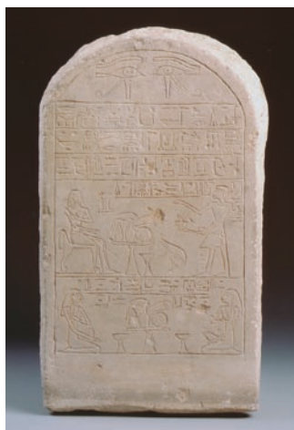
Ancient Egyptian materials Limestone Stele of Nefer-hetep-seneb (12 th Dyn., Abydos, Egypt)