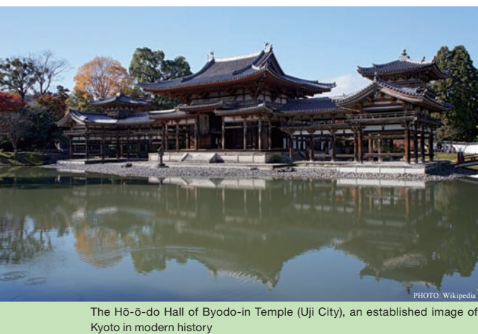
The Hō-ō-do Hall of Byōdō-in Temple (Uji City), an established image of Kyoto in modern history

Collaborative Research on Kyoto, Japan's Ancient Capital, and other Historical Cities.