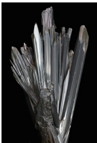
Stibnite (Ehime, Japan)

A notable characteristic of the Chinretsukan was that it contained specimens and materials from a wide variety of areas around the world: from Korea and China to Southeast Asia, India, Afghanistan, Europe, and America. Among the items it formerly housed, the ancient Egyptian materials sent by Sir William Matthew Flinders Petrie, who is known as the father of Egyptian archeology, have been receiving attention from international researchers in recent years for their high academic value.