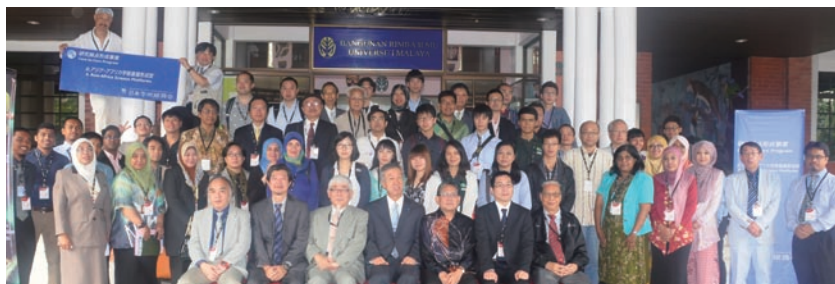
The 4 th International Symposium on Asian Vertebrate Species Diversity on 18–19 December 2014.