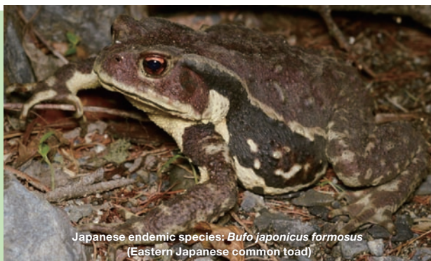
Japanese endemic species: Bufo japonicus formosus (Eastern Japanese common toad)

Japan is one of the world's biodiversity hotspots, with a large number of diversified vertebrate species, including many endemic to Japan. This is mainly the result of alternating periods of geographical isolation and connection with the continent over millions of years. Comprehensive studies involving counterpart species in continental Asia are essential in elucidating the origin and evolution of species diversity in Japan. For these important and large scale endeavors, it is necessary to promote academic exchange and cooperation among Asian vertebrate researchers, and also to train young researchers through the Asian multilateral research framework. To pursue this challenging endeavor, the Kyoto University Museum is conducting the JSPS Core-to-Core Program B. Asia-Africa Science Platforms Asian Vertebrate Species Diversity Network Platform with Combining Researchers, Specimens and Information .