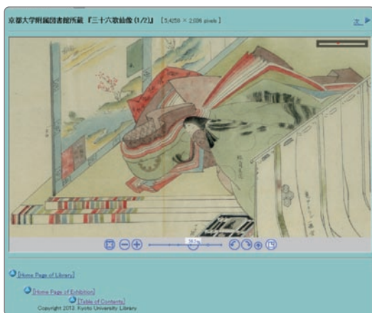
Image of the colorful picture scroll Sanjurokkasen-Zo