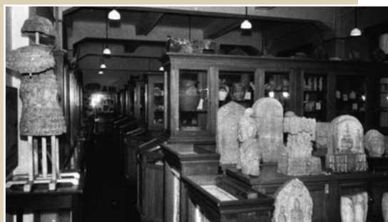
Chinretsukan's exhibition room

After three extensions to the original building, which was constructed in 1914, the Chinretsukan (Exhibition Hall) reached its final form as a square building surrounding a courtyard in 1929. The old brick building was partially reinforced with concrete during its final extension, but it remains a representative Kyoto University building of its time. The building was co-designed by Jihee Yamamoto, who designed many structures for higher education institutions and hospitals at the time, and Kyozeo Nagase. Yamamoto and Nagase later became the first and second directors of the Department of Engineering of Kyoto Imperial University. In addition to being a place for research and education, the Chinretsukan was an "open space" for the public exhibition of historical materials. Being equipped with a reception room, it also served as a place to receive guests until the Clock Tower was built in 1925.