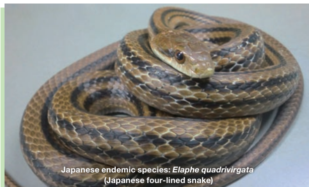
Japanese endemic species: Elaphe quadrivirgata (Japanese four-lined snake)

Understanding of Japanese Biodiversity with Asian Network.