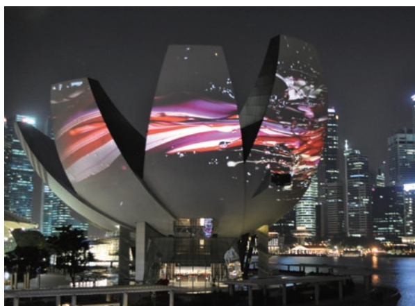
Projection mapping “Sound of Ikebana: Four Seasons”

WEB www.g-mark.org/award/describe/41746?token=cMdCoS2zYp&locale=en (Good Design Award)