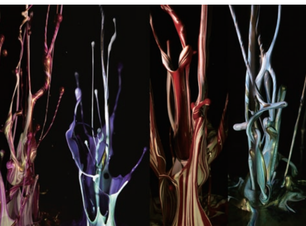
Spring, Summer, Autumn, Winter