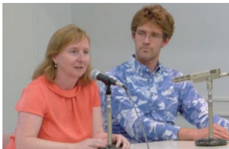
Symposium Series: “My Work and Career Design”

The center hosts various symposia, study meetings, and training programs related to gender equality and career development of researchers.