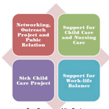
Four Programs of the Center