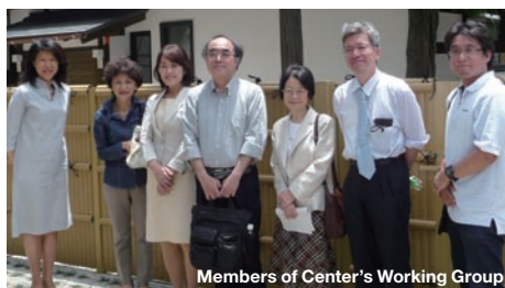
Members of Center's Working Group

The center's facilities are available for small meetings or temporary child care during study meetings, etc. Books on gender equality and work donated by female faculty members are also available for lending.