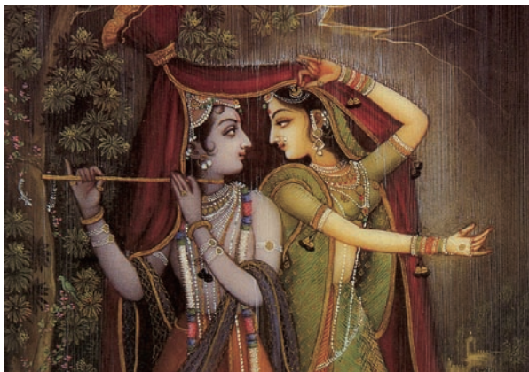
God Krishna (Left) and his lover Radha (Right)

precise, as something fundamentally detrimental to the pursuit of enlightenment. However, South Asian thinkers in the school of Bhakti (devotion) argued that passionate and emotional attachment can become a powerful tool for enlightenment if it is targeted toward God. My research focuses on the development of this Bhakti school in the context of South Asian intellectual history, especially during its early modern period.