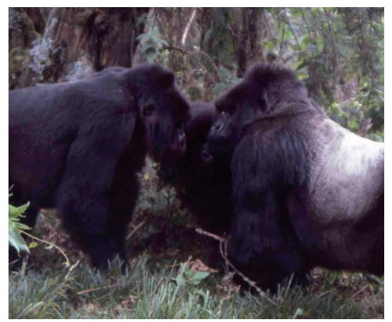
Face-to-face communication of gorillas