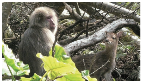
Japanese macaque and deer

to the conditional equality of human society. The origin of human family and sociality is still a major focus in primatology and anthropology. The conservation of endangered species, including great apes, and the preservation of indigenous cultures have also become important tasks. With the rapid advancement of globalization, field studies on human and non-human primates are