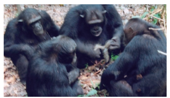
Meat sharing among chimpanzees