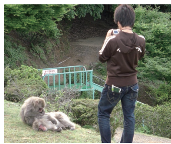
Student field work at Arashiyama Monkey Park