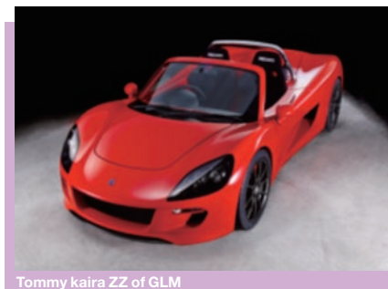
Tommy kaira ZZ of GLM

In order to promote and nurture university spin-offs, a venture capital called KUVF (Kyoto University Venture Fund) has been established in 2007 with amount of 4.5 billion JPY (or approximately 45 million USD). At the end of FY 2012, KUVF has an investment portfolio of 16 companies.