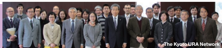
The Kyoto URA Network

As part of a new national government initiative, the Kyoto University Research Administration Office (KURA) was officially launched in April 2012 as an organization to provide consistent research support for project planning, obtaining research funds, project execution, and public relations by providing a well-organized research support network.