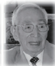
Kiyosi Ito 2006