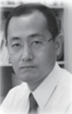
Shinya Yamanaka 2009