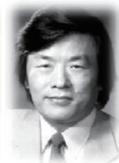
Susumu Tonegawa 1987