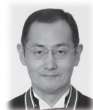
Shinya Yamanaka 2010