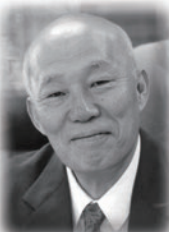
Yasutomi Nishizuka 1989