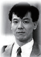
Shigefumi Mori 1990