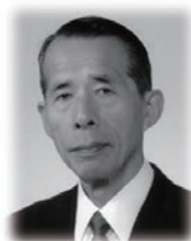
Makoto Nagao 2005