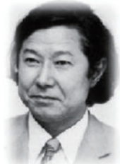
Heisuke Hironaka 1970