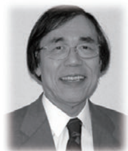
Masatoshi Takeichi 2005