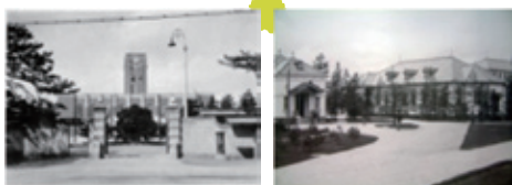
[left] The Clock Tower, as seen in 1925 [right] The original university library (built in 1899) and the Sonjodo building seen to the left.

*Both photos are preserved in the Kyoto University Archives