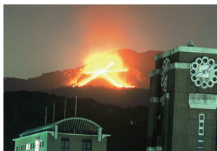
Daimonji Mountain as seen from Yoshida Campus