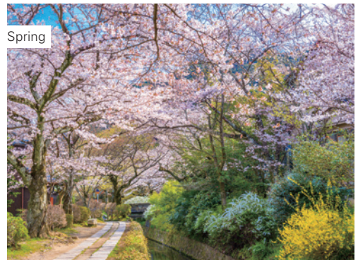
The picturesque Philosopher's Walk pathway in Kyoto