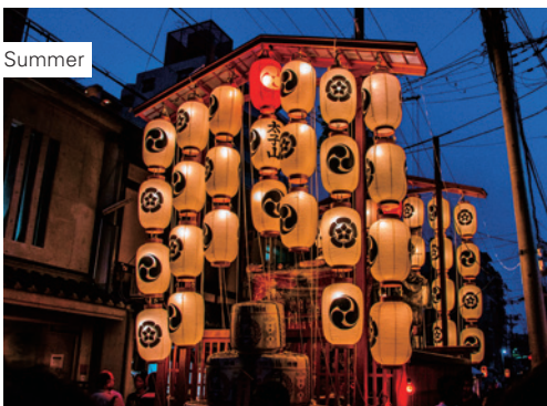
A float decorated with paper lanterns during the Gion Festival