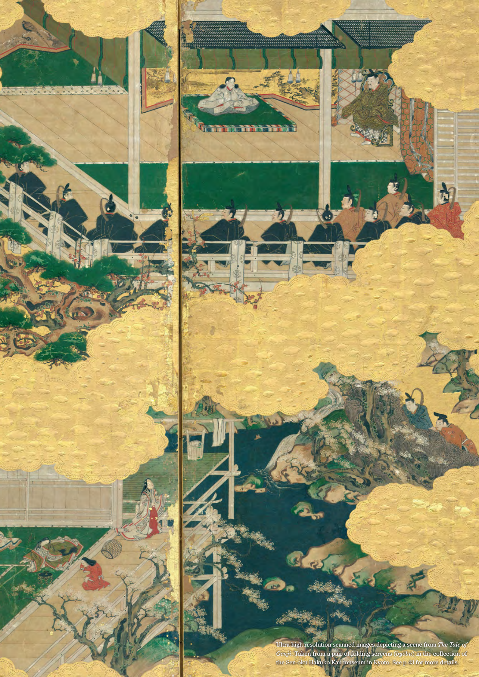
Ultra-high resolution scanned images depicting a scene from The Tale of Genji . Taken from a pair of folding screens ( byōbu ) in the collection of the Sen-oku Hakuko Kan museum in Kyoto. See p.43 for more details.