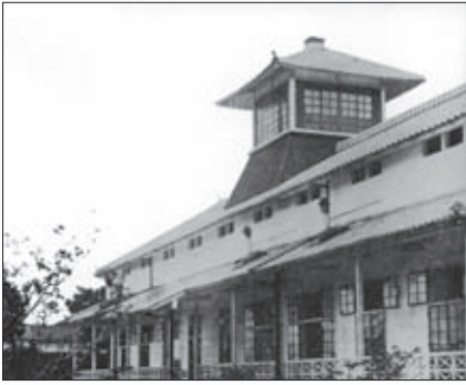
The Seimikyoku was established in Osaka as a school of higher learning in chemistry and physics.