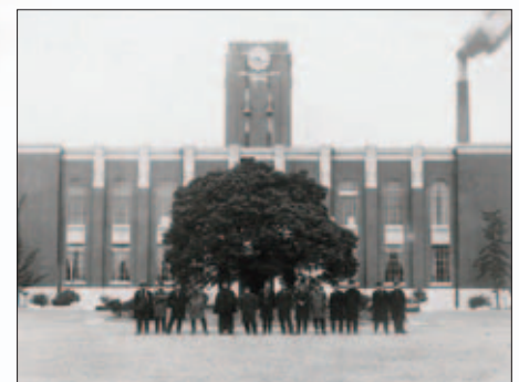
Students standing in front of the Clock Tower and the first camphor tree. The current camphor tree was planted in 1934 after the first tree was destroyed by a typhoon.