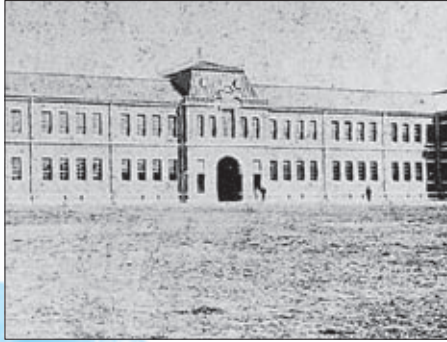
Known at this point as the Third High School, the institution was relocated to Kyoto in August 1889.