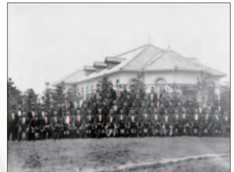
Kyoto University's first graduates assembled in front of the library.