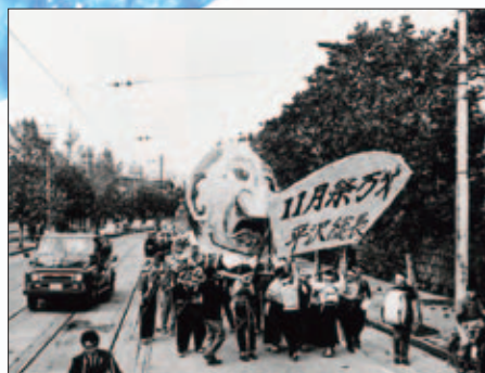
Student parade during the annual November Festival.