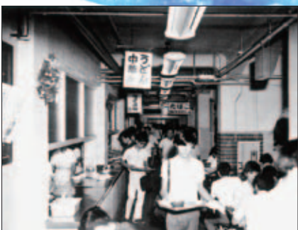
Cafeteria in the basement of the clock tower.