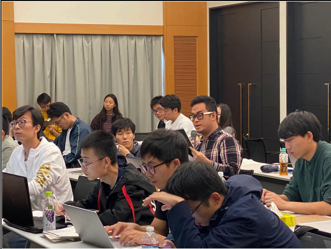
5th International Workshop on Environmental Issues for Young Students and Researchers by Young Students and Researchers