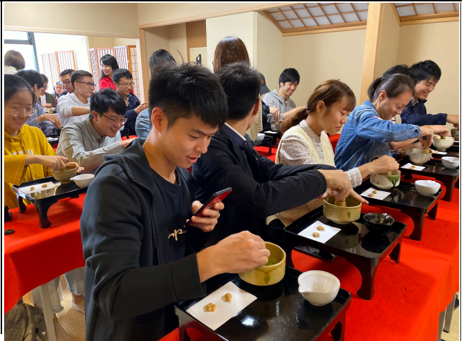
Traditional Cultural Experience