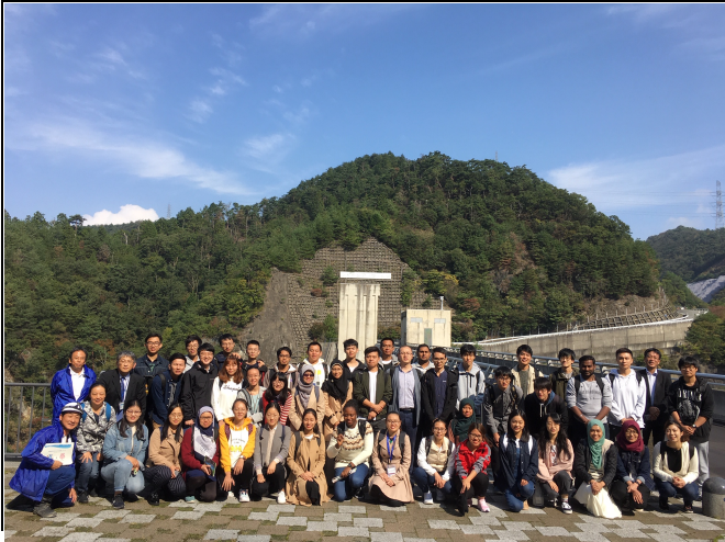
Landfill site in Kyoto City