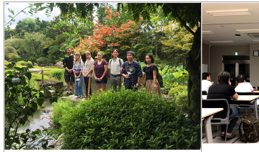
Touring Taizo-in Zen Buddhist Temple

In addition, the students took an overnight tour of Kyoto to experience the city's rich cultural heritage. The first day included exploring Japanese garden at the Taizo-in Buddhist temple and the second day included lectures by WRC professors and graduate students.