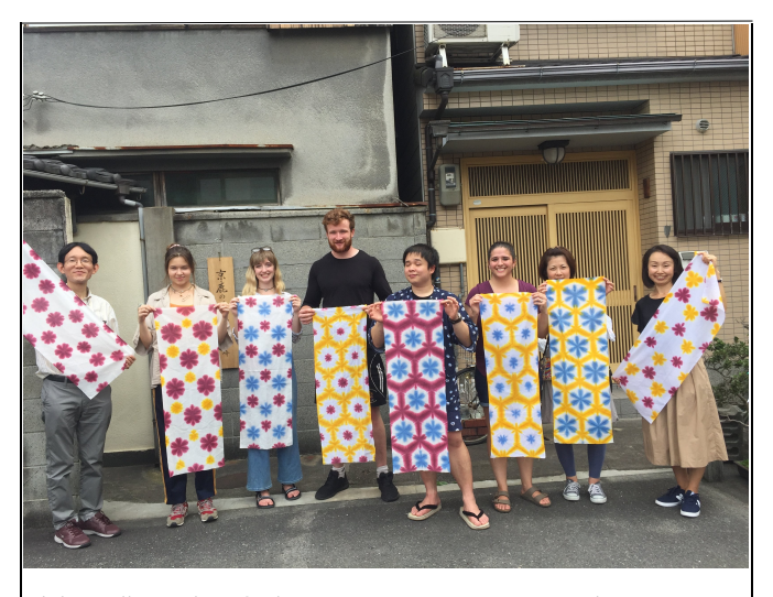
Handkerchief dyeing experience with a traditional technique from the Edo period