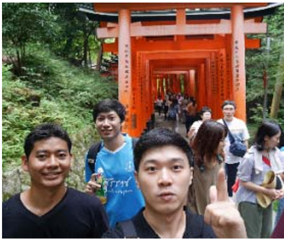
At Fushimi Inari Shrine