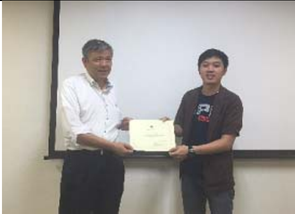
Donation of the certificate of internship at IAE