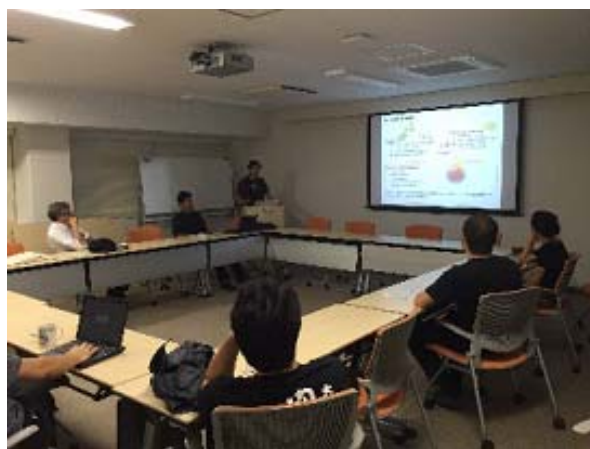
Presentation of the output of the internship