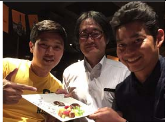
At welcoming party