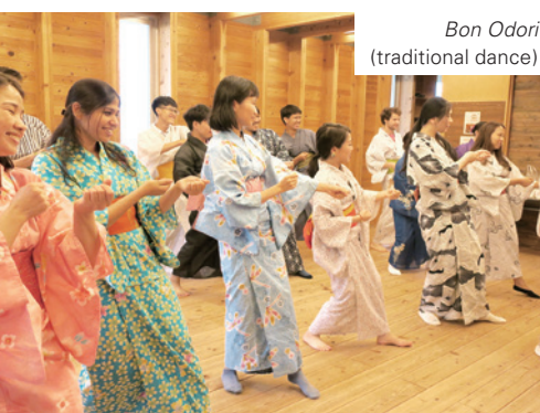
Bon Odori (traditional dance)

Students and researchers at Kyoto University find that the vibrant backdrop of Kyoto City brings constant inspiration and new discoveries in their daily lives and academic endeavors.