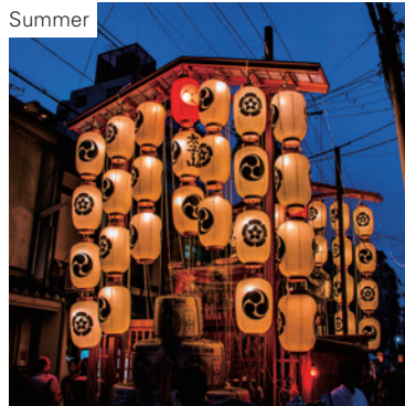
A float decorated with paper lanterns during the Gion Festival