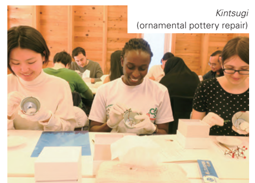
Kintsugi (ornamental pottery repair)