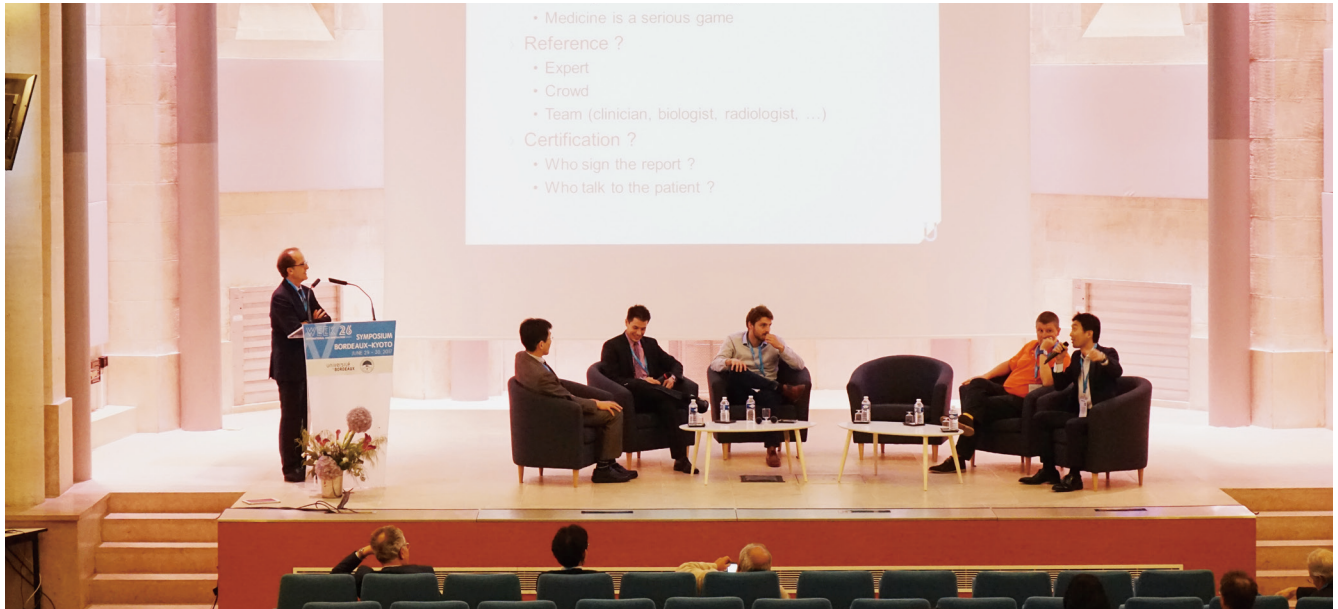
The 3 rd Bordeaux-Kyoto International Symposium (2017)

Research generates knowledge, and making that knowledge available for the benefit of society is one of the university's key missions. In order to promote synergistic relationships with partner institutions and interdisciplinary approaches to research, Kyoto University regularly holds international symposia in collaboration with partners around the world. The symposia are hosted either in Kyoto or on the campuses of the co-hosting partner institutions. They bring leading researchers from around the world together to share the latest developments in their work, share their passion and enthusiasm, and promote research collaboration.