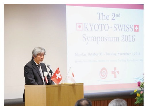
The 2 nd Kyoto-Swiss Symposium (2016)

Following up on the first symposium, which was held in Zurich in 2013, the 2 nd Kyoto-Swiss Symposium was held on Kyoto University's Yoshida Campus in 2016. Researchers from the University of Zurich and Kyoto University shared their knowledge and explored possibilities for collaboration in the fields of healthy aging, primatology, botanical science, digital science, art history, and regenerative medicine.