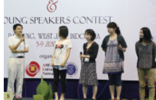
8. The 14th AUN and 3rd ASEAN+3 Educational Forum and Young Speakers Contest at Institut Teknologi Bandung, Indonesia.

Kyoto University offers two types of exchange programs: the Kyoto University International Education Program (KUINEP) and the Kyoto University General Exchange Program. Both programs last for a maximum of one year, and are open to international students from institutions with a student exchange agreement with KU. KUINEP provides undergraduate level lectures in English to undergraduate exchange students as well as KU students. In General Exchange Program, exchange students mainly take ordinary courses which are generally taught in Japanese in undergraduate faculties or in graduate schools each student is affiliated. Graduate students are also allowed to research under his/her academic advisor's supervision without taking courses.