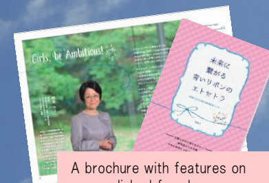
A brochure with features on accomplished female researchers (FY2015)