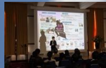
The Interdisciplinary Research Ideas Contest (FY2017)

Providing researchers with opportunities to undertake interdisciplinary research, including the Interdisciplinary Research Ideas Contest, A Hundred Papers by a Hundred Researchers at Kyoto University: Broadening Research through Unexpected Connections exhibition, and other events.