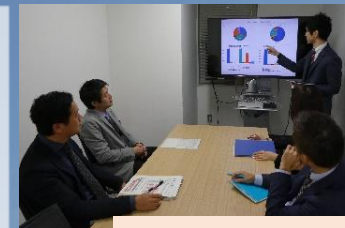
A meeting at the IR Office.

The Institutional Research (IR) Office was established in FY2015 to facilitate the evidence-based management of the university in cooperation with the Kyoto University Research Administration Office (KURA). The position of provost was established in FY2017. The provost oversees the formulation and implementation of university-wide strategies.