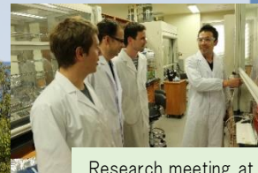
Research meeting at a KUIAS laboratory

A World Premier International Research Center established in FY2016 as a hub for the advancement of cutting-edge research.