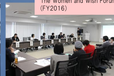
The Women and Wish Forum (FY2016)