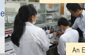
An ELCAS class

-The WINDOW Concept- A Vision for the Future of Kyoto University Performance Report