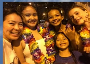
Students engaged in projects overseas

An international program launched in FY2016 to enable students to travel abroad to pursue unique projects planned by the students themselves. The program aims to cultivate global human resources who can be active in international society.