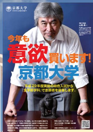
A poster for the Special Admission System

In FY2016, a new admission system was established that is based on a comprehensive assessment of the candidate students' abilities, motivation, and goals.