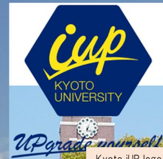
Kyoto iUP logo

A program for international undergraduate students launched in FY2017 that aims to cultivate global human resources. A key feature of the program is that it does not require students to have Japanese language ability at the time of admission.