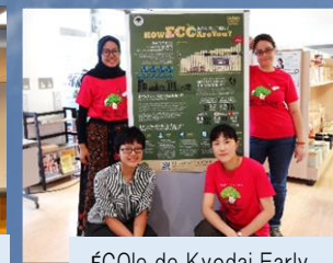
ÉCOle de Kyodai Early Summer Campaign (FY2017)