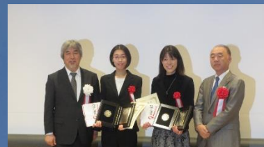
Presentation ceremony for the Tachibana Award (FY2016)