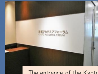
The entrance of the Kyoto Academic Forum