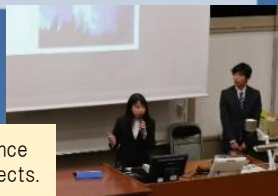
Meeting to announce the selected projects.

Other fund-raising activities, including a book donation program and a program to donate part of the profits made by approximately 100 vending machines.