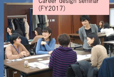
Career design seminar (FY2017)

Various initiatives have been implemented, including career design seminars for female staff members, the Tachibana Award, which acknowledges the achievements of outstanding female researchers and doctoral students, and the Woman and Wish Forum, which explored the issues facing female researchers.