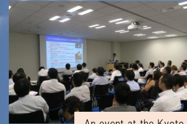
An event at the Kyoto Academia Forum