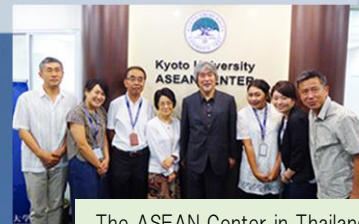
The ASEAN Center in Thailand

In addition to Kyoto University's ASEAN Center in Thailand and European Center in Germany, in FY2016, the university made plans to establish a new branch office in the US.