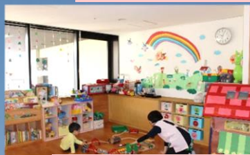
Care service for sick children