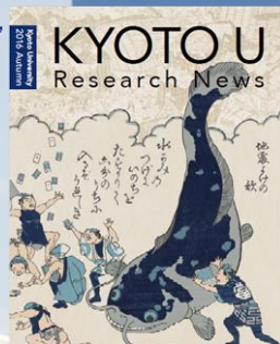
KYOTO U Research News

The university disseminates its research results through diverse media, including KYOTO U Research News (a periodical brochure launched FY2016), the Activity Database on Education and Research, the Kyoto University Research Information Repository (KURENAI), and the Kyoto University Research Resource Archive (KURRA).