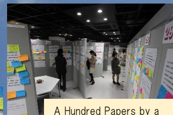
A Hundred Papers by a Hundred Researchers at Kyoto U (FY2016)