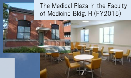
The Medical Plaza in the Faculty of Medicine Bldg. H (FY2015)

Earthquake-proofing for a safe and secure campus. Increasing awareness by sharing information about the university's ongoing efforts towards sustainable campuses and inter-university networks.