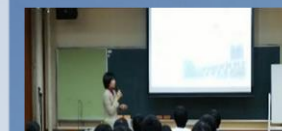
A class being taught by a graduate school student through the Learning Coordinator Initiative (FY2017)

-Learning Coordinator Initiative: Courses coordinated and taught by the university's graduate school students at high schools or at the university. -Experience-based Learning Course for Advanced Science (ELCAS): For the ELCAS courses, high school students visit the university to be taught directly by faculty members. In FY2017, the ELCAS courses were expanded to include humanities and social science fields.