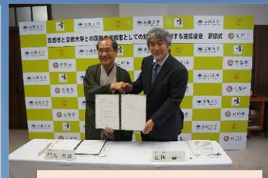
At the signing ceremony for the “International Academic City” Cooperation Agreement

Kyoto University and the Kyoto municipal government concluded an agreement in FY2015 to internationally disseminate Kyoto's academic culture by promoting the holding of international conferences in the city and other initiatives.