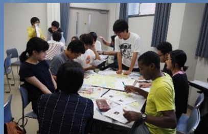
Students participating in the Consortium for International Human Resource Development for Disaster-Resilient Countries.

A program for international students launched in FY2016 that provides international and Japanese students with opportunities to study together.