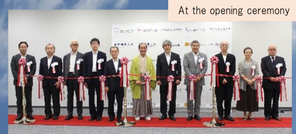
At the opening ceremony

The Kyoto Academic Forum was co-founded by Kyoto University and nine partner universities located in Kyoto in FY2017. It aims to disseminate academic information on culture, art, and science from Kyoto.