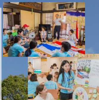
China-Japan-Korea SERVE Initiative 2017 (Summer Program)

The university implements summer programs in collaboration with local communities, including programs with Kyoto City, Seika, Miyama, and Miyazu City in FY2017. Through the programs, international students from Hong Kong, China, and South Korea joined Kyoto University students to learn from and work with the elderly in local communities.