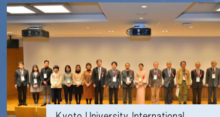
Kyoto University International Symposium for the Establishment of Sustainable Campuses (FY2016)