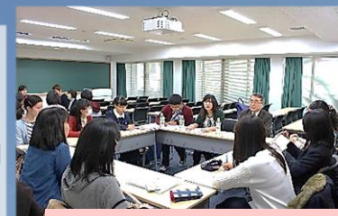
Round Table Forum for Female High School Students (FY2016)

Kyoto University faculty members and students provide information about study and research at the university and answer questions from female high school students.