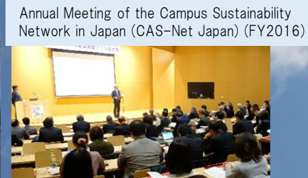
Annual Meeting of the Campus Sustainability Network in Japan (CAS-Net Japan) (FY2016)