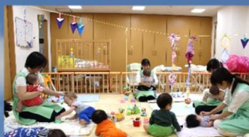
Care service for infants awaiting public day care

In FY2016, several measures were implemented to improve child-rearing support services and promote work-life balance, including care services for infants awaiting public day care, care for sick children, and child pick-up and care services.