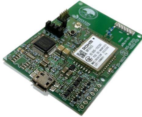
Figure 2: Wireless module equipped with common firmware