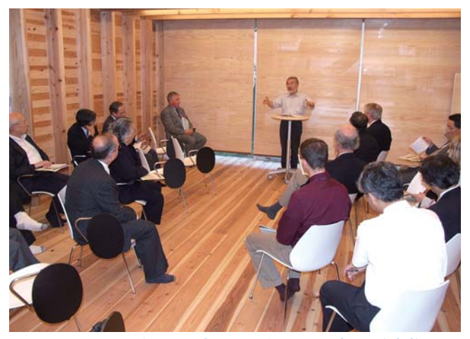
The opening ceremony of the Kyoto Consortium for Japanese Studies (KCJS)

Kyoto culture or research on Japan. It is hoped that the international students will be inspired by the warmth and fresh woody scent of the building while they study Japanese culture.