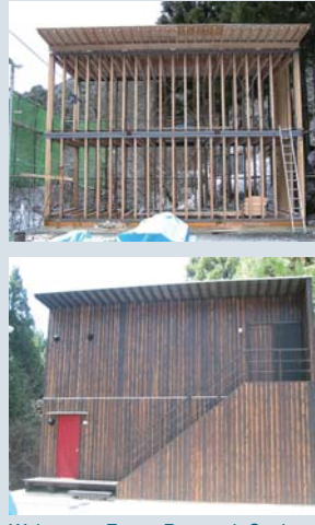
Wakayama Forest Research Station