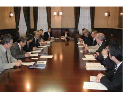
Reviewers from OECD Thematic Review of Tertiary Education