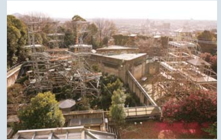
Outdoor compound of chimpanzees in KUPRI

A community of 14 chimpanzees of 3 generations inhabit an enriched, seminatural environment at the Primate Research Institute of Kyoto University (KUPRI). KUPRI is located in Inuyama,