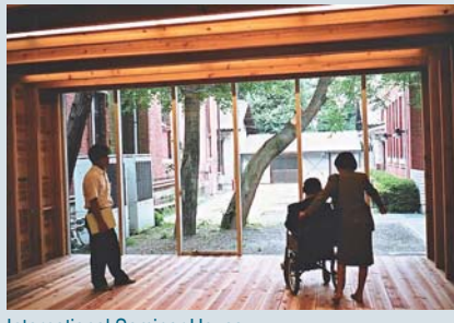
International Seminar House

system that would enable supply at the time of a large scale disaster, it would be possible to quickly respond to large-scale emergency housing demands. We believe j.Pod has the potential to offer an environment of wooden surrounds in which survivors, who may have lost loved ones, or who have suffered injuries, can spend their time with as much a sense of security that is possible under the circumstances.