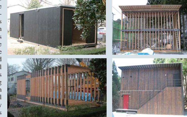
Northern Precinct Kyoto University