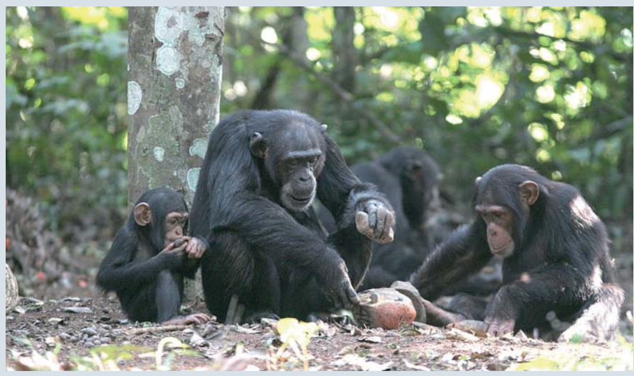
Stone tool use by chimpanzees at Bossou, Guinea

Chimpanzees have been used for biomedical research on, for example, AIDS, hepatitis, and malaria. There are still more than 1500 chimpanzees kept in biomedical laboratories across the USA. In Japan, three pharmaceutical companies have in the past used chimpanzees for biomedical research. However, all invasive studies ceased from October 2006, thanks to the SAGA movement. We are now setting up a sanctuary for those 79 chimpanzees who were once the subjects of biomedical research. I want to follow my dream: One day, I hope to see humans and chimpanzees living together - as neighbors and evolutionary cousins.