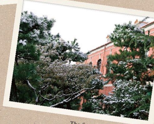
The four seasons of Kyoto