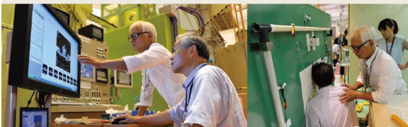
Radiation treatment for cancer patients.