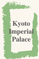
Kyoto Imperial Palace