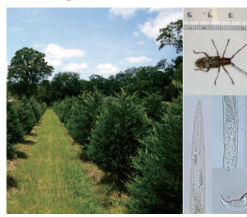
Christmas tree farm (left) a source of both the vector beetle (upper right) and the pathogenic nematode (bottom right).

meetings will be a great asset to this important field of research.