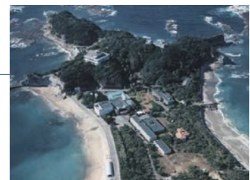
Areal view of Seto Marine Biological Laboratory