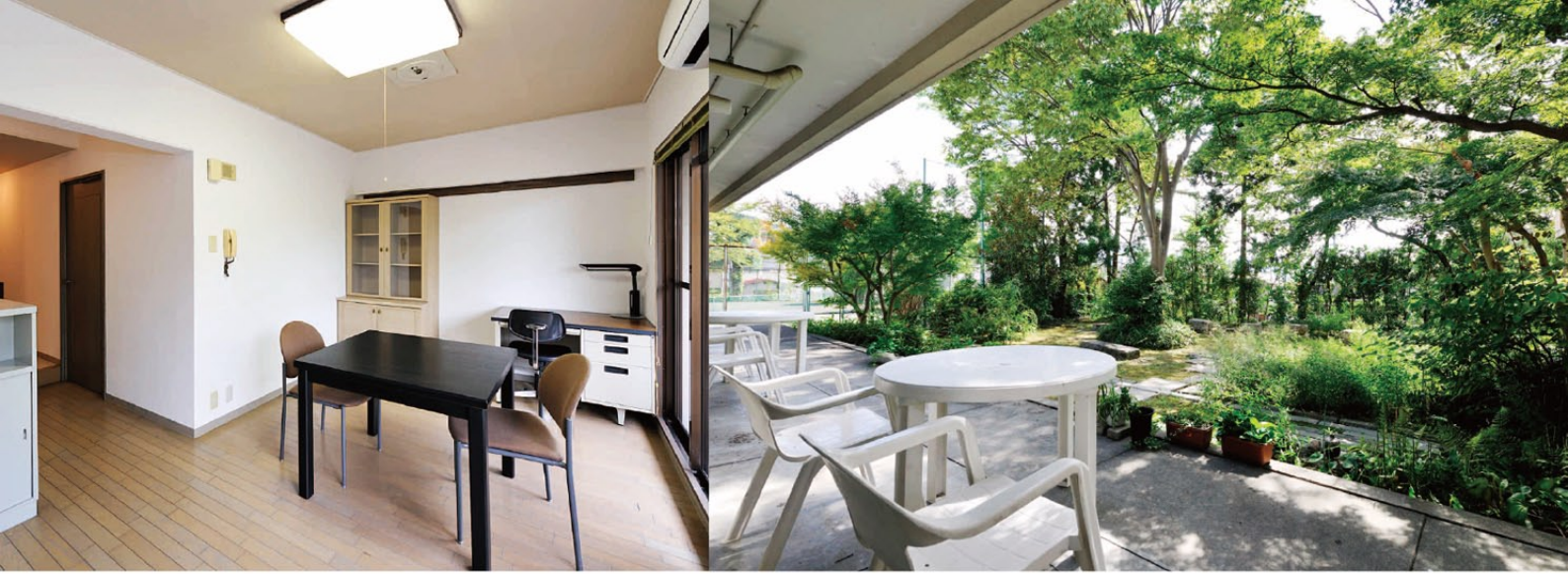
Misasagi International House