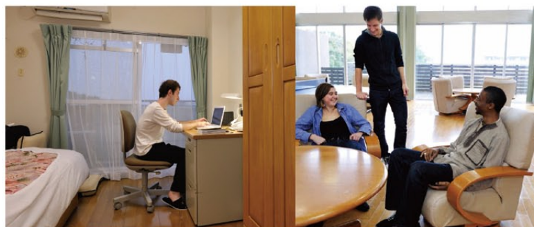
Ohbaku International House