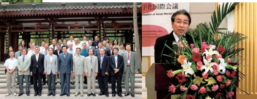
International symposium at Xi'an Jiaotong University.